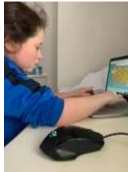
6 th January English assignment

I found this smooth brown pebble in my garden. It was cold and small. It rolled and tumbled when I pushed it. It warmed up when I held it and didn't let it fall.